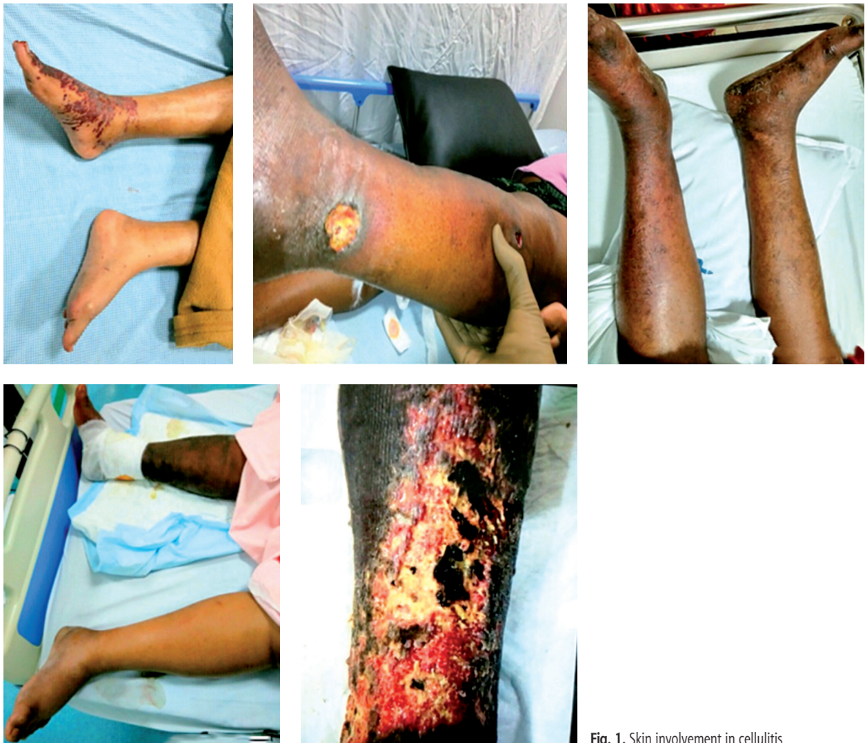
Fig. 1. Skin involvement in cellulitis

We noted that the majority of patients had lower limb involvement and only a few had isolated upper limb or scrotal involvement. Three fifth of patients had superficial ulcers.